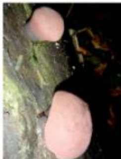
7 Daldinia eschscholzii