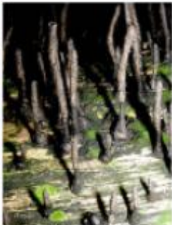
19 Xylaria feejeensis