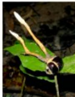
6 Cordyceps militaris [on scarab beetle]