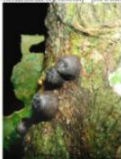
3 Camillea cyclisca