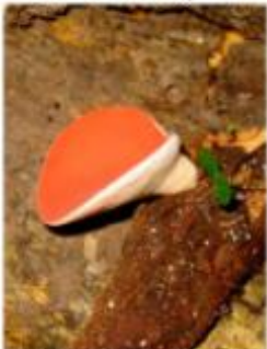
15 Phillipsia dominguenis