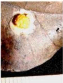
10 Hypocrella [on scale insect, on Bignoniaceae]