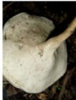
16 Phillipsia dominguenis