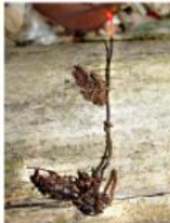
12 Ophiocordyceps australis [on Pachycondyla ant]