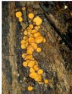
17 Scutellinia scutellespora aff.