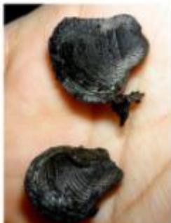
8 Daldinia eschscholzii