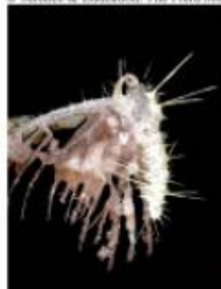
1 Akanthomyces ASCOMYCETE →