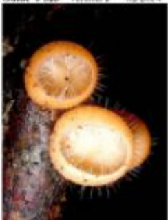
5 Cookeina tricholoma