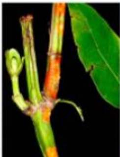
9 Hyperdermium bertonii [on Uncaria toona ]