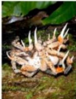
18 Torrubiella [on tarantula spider]