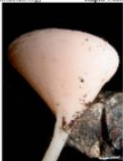
4 Cookeina speciosa