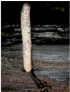
20 Xylaria lockes