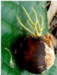
14 Penicillioopsis clavariiformis