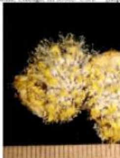
2 Aspergillus flavus [inside Oenandra seed]