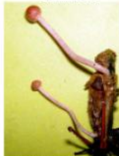
11 Ophiocordyceps amazonica [on orthopteran]